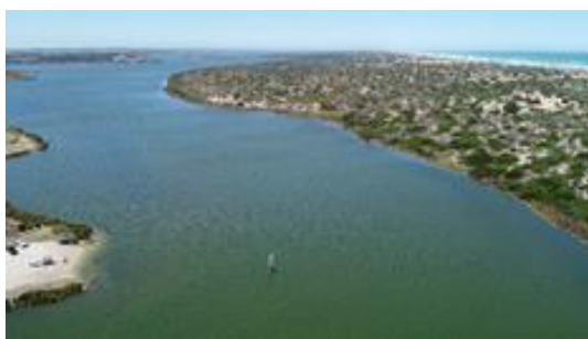
Image 2. Parnka Point